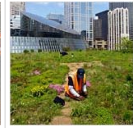
Chicago Prepares for a Warmer Future