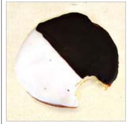
Room for Debate: Is Anti-White Bias a Problem?