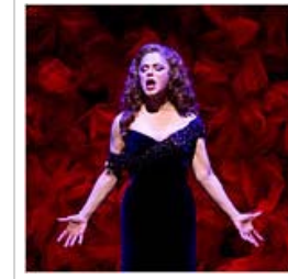
Broadway Babies' Glory Days