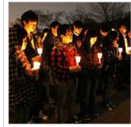
South Korean University Rattled by Suicides