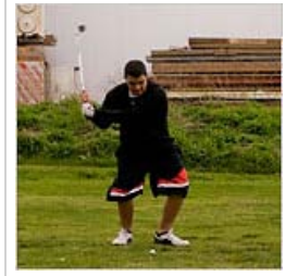
When a Bad Golf Course Edges Into Goodness